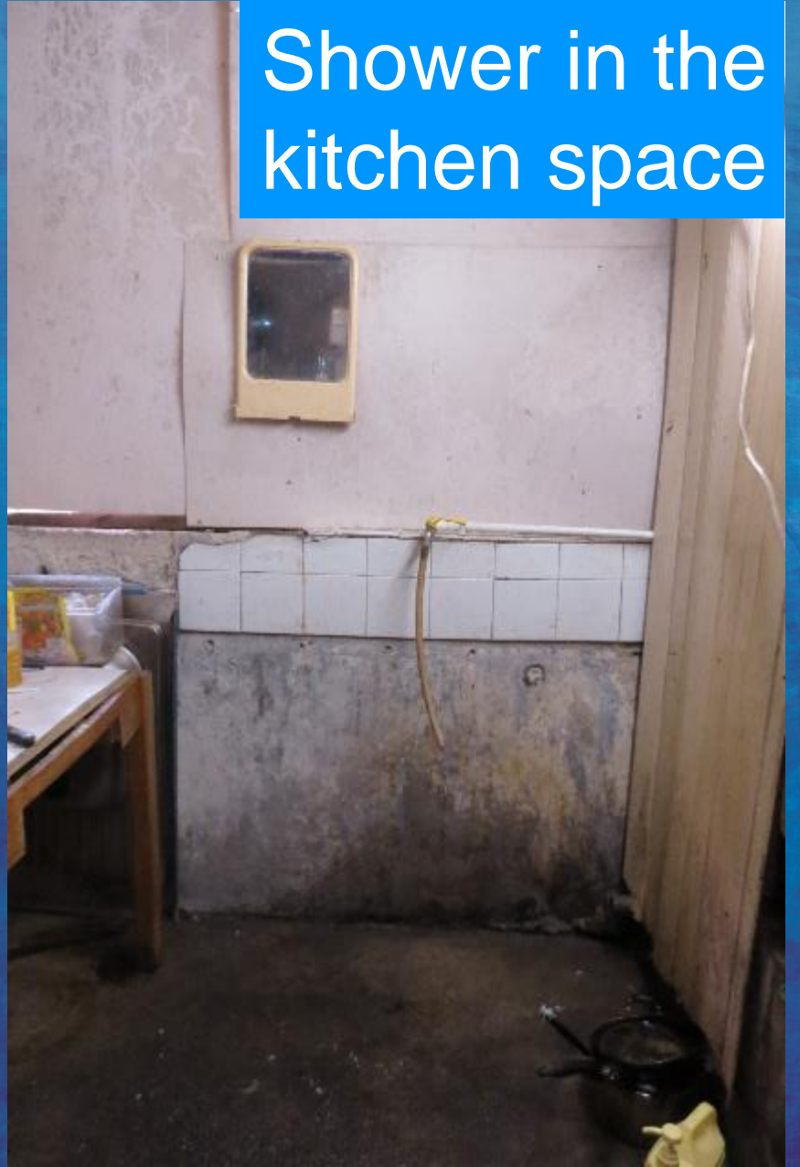
SAFEGUARDING REFUGEE RIGHTS