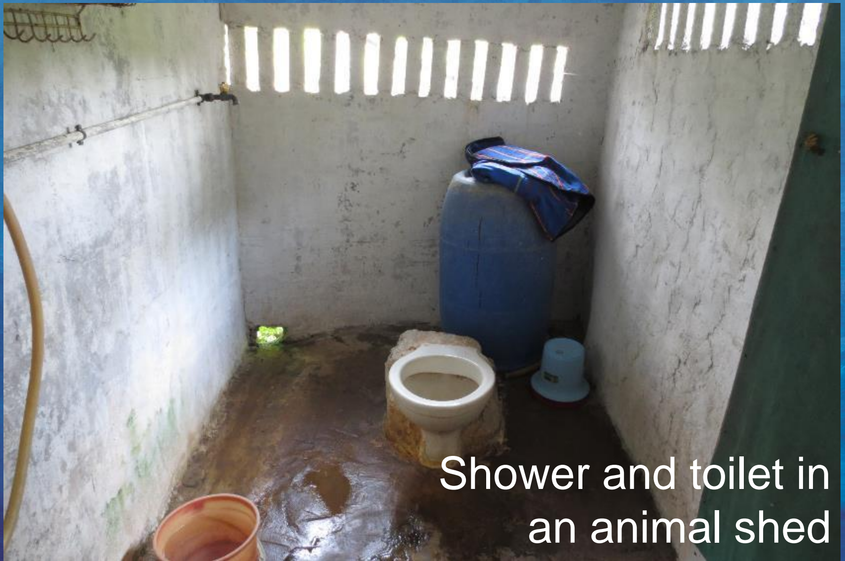
Shower and toilet in an animal shed