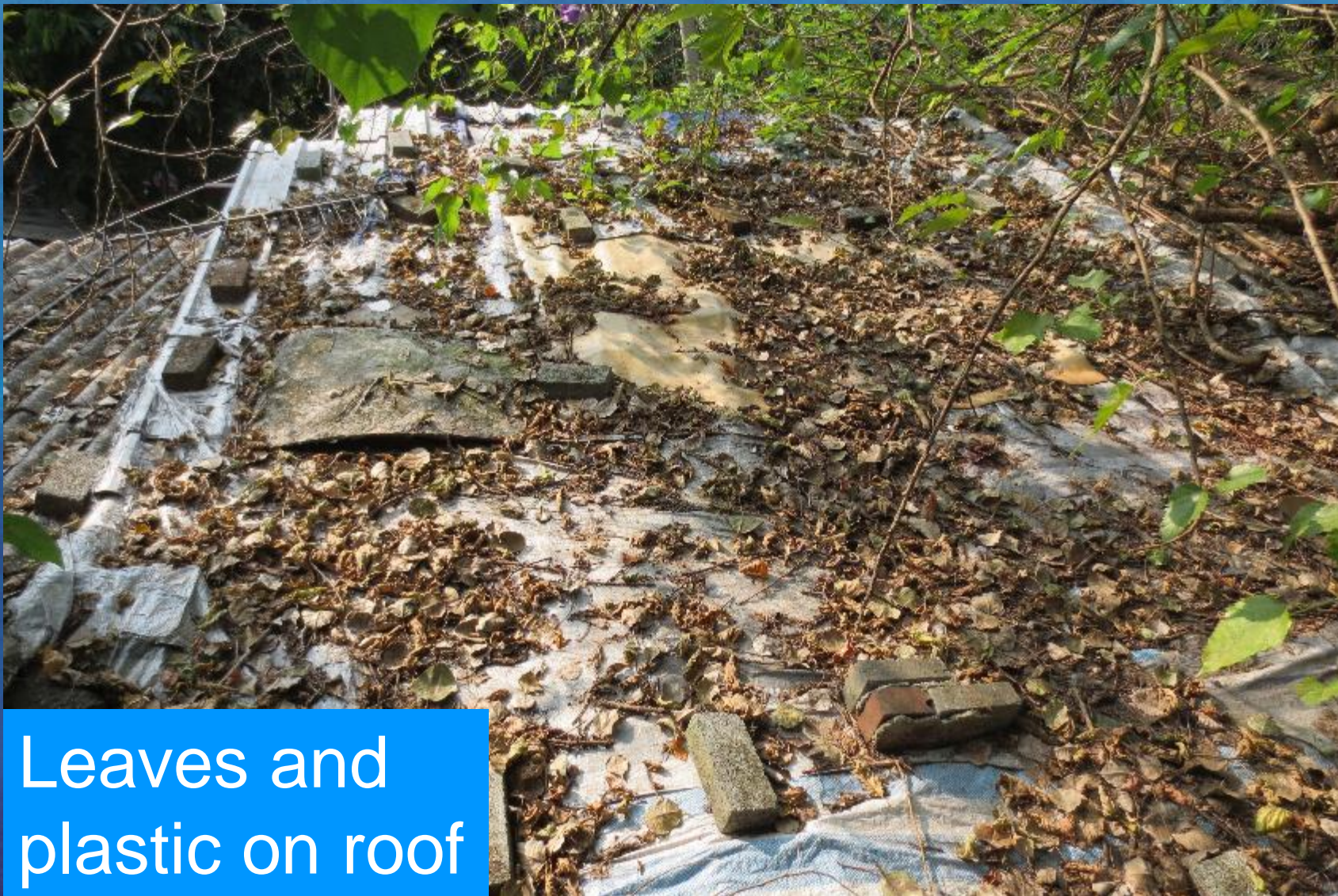
Leaves and plastic on roof