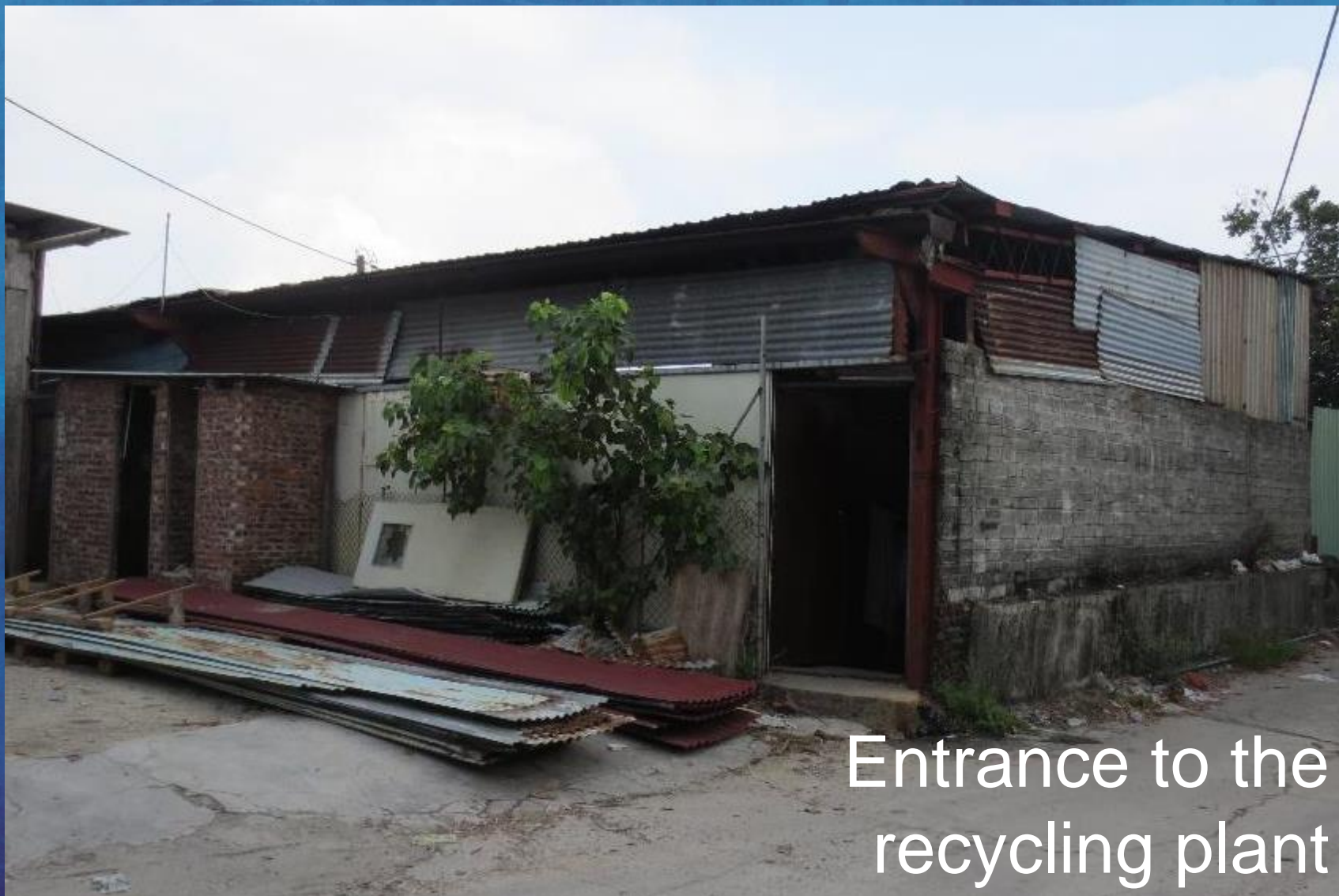
Entrance to the recycling plant