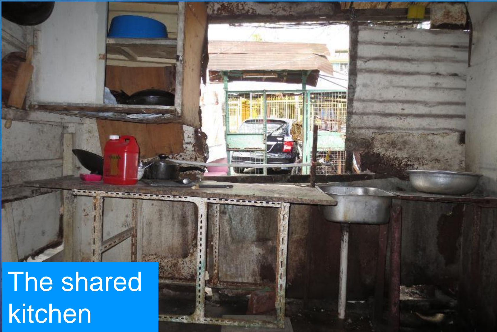
The shared kitchen