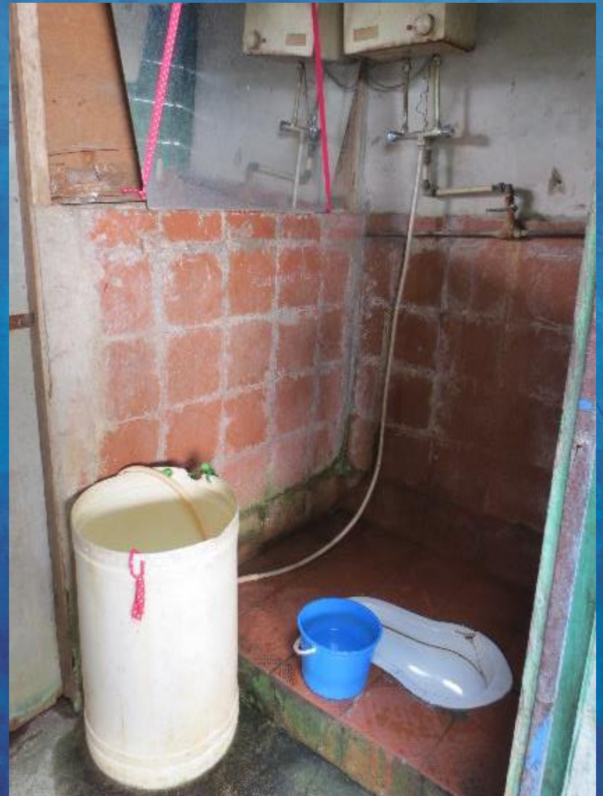
An toilet-shower combo